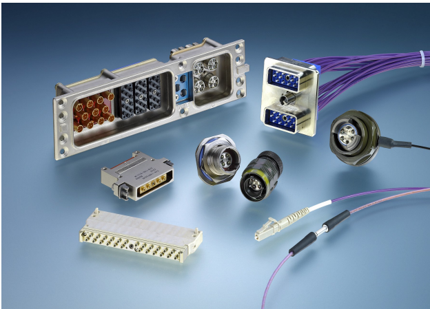
Figure 4. Designers have a full range of options for optical connectivity

The day when fiber's reputation as a fragile and hard-to-use medium are long past. Fiber-optic cables also offer easier use over past versions. Constructions offer crush resistance and resistance to pinching during installation. Fiber preparation during termination is easier, while no-epoxy/no-polish connectors significantly simplify the skill and times required for installation.