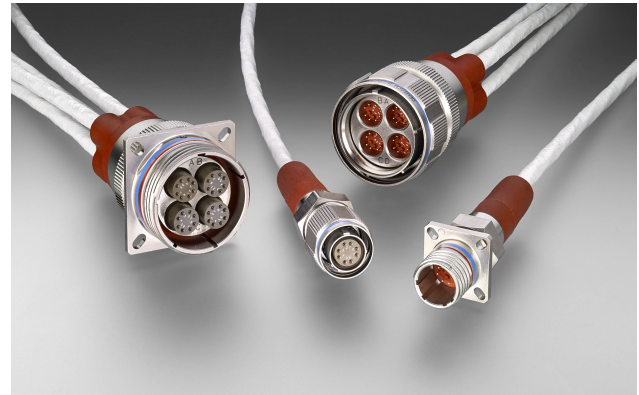
Figure 3. A new generation of circular connectors supports 10 Gb/s Ethernet over copper.

To address this gap in fast copper connectivity, TE Connectivity (TE) has recently introduced three families of CeeLok FAS-T and FAS-X connectors capable of 10 Gb/s performance (an example of which is shown in Figure 3), each of which offers specific advantages to designers in performance and size.