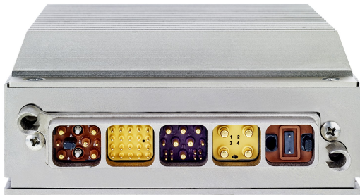
Figure 2. Lightweight composite enclosure

Figure 2 shows a MiniMRP enclosure that has integrated connector shells molded into the structure. This cuts down on the number of piece parts for the application and makes assembly easier. The enclosure accepts standard EN4165/ARINC 809 inserts to provide the flexibility obtained from the wide range of modules available. The modules in the figure offers signal, power, RF, and optical connectivity.